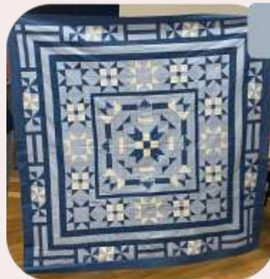
Janice Haluszka Block of the Month