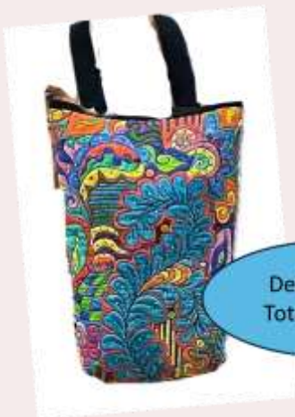
Debbie Winn Tote Backpack