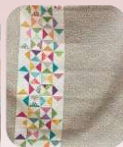
Suzette Lucier Chevron – Front and Back