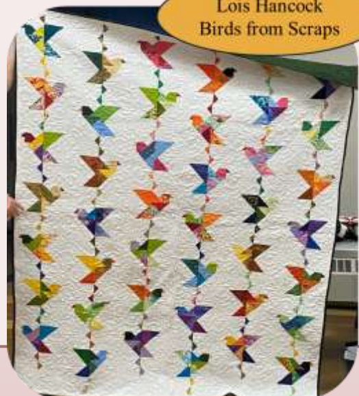
Lois Hancock Birds from Scraps