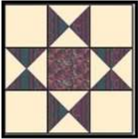
Quilting is a Way of Life