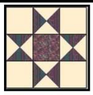
Quilting is a Way of Life