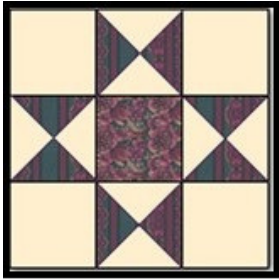
Quilting is a Way of Life